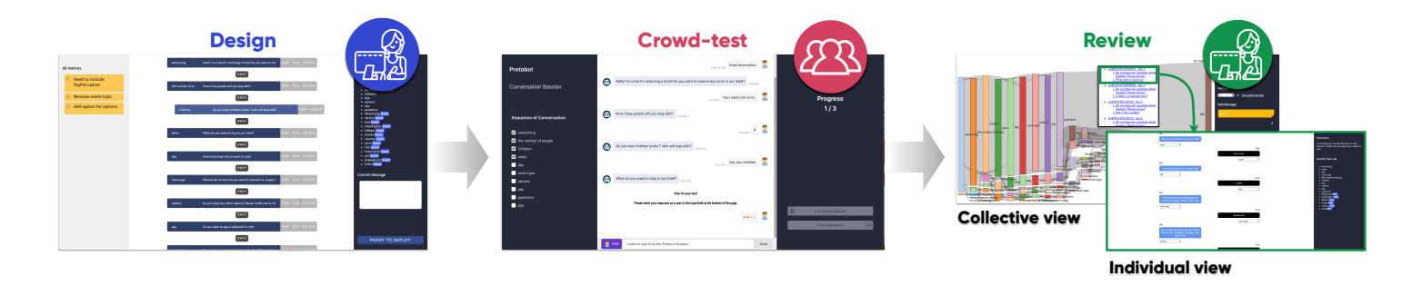
Figure 1: Conversation design process with ProtoChat. Designers can design a conversation, test with the crowd, and browse and analyze the crowdsourced conversation.

so that they could improve the design. The crowd enabled need-finding of the chat domain which is important in the early stage of conversation design. Moreover, the crowd provided evidence for decision making regarding later versions of the design. This research aims to help chatbot designers with crowd power, from collecting conversation scenarios by crowd contribution to effectively representing the crowdsourced output, which enables designers to explore potential scenarios, important in understanding the needs and use cases of real users.